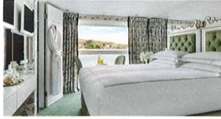
Category 2 stateroom