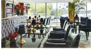
Bar du Leopard

Royal Suite: 1 (410 sq ft) / Suites: 5 (305 sq ft) / Category 1 Staterooms: 23 (194 sq ft) / Categories 2-3 Staterooms: 38 (194 sq ft) Categories 4-5 Staterooms: 12 (162 sq ft) / Category 5 Single Stateroom: 1 (120 sq ft)